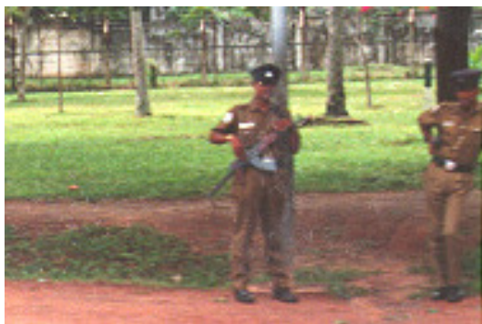
Heavily armed police in Colombo, Sri Lanka

After a 25 year battle with the Liberation Tigers of Tamil Elam, Sri Lankan president Mahinda Rajapaksa declared victory in his country's battle against the LTTE, which was declared a terrorist organization by 32 countries.